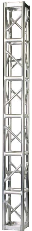
Item No. 10-12-120